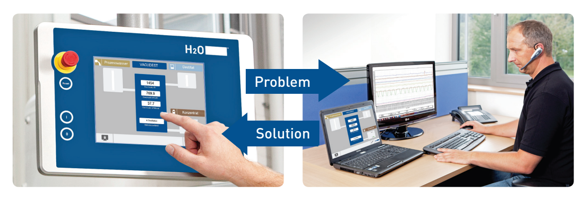
Effective and low cost support: Our Vacutouch control systems transfer process data to our specialized technical customer support team.

Via e-service the problem is identified quickly and a respective soluiton is provided. In 8 out of 10 cases an on-site service visit is not necessary any more.