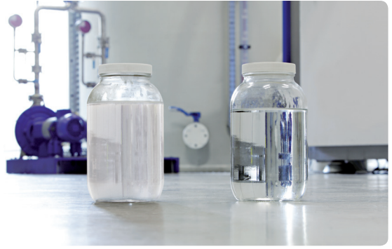
Even for modern wastewater treatment systems, processing of oily industrial wastewater is a challenge. Mostly complex multi-stage treatment processes are required.