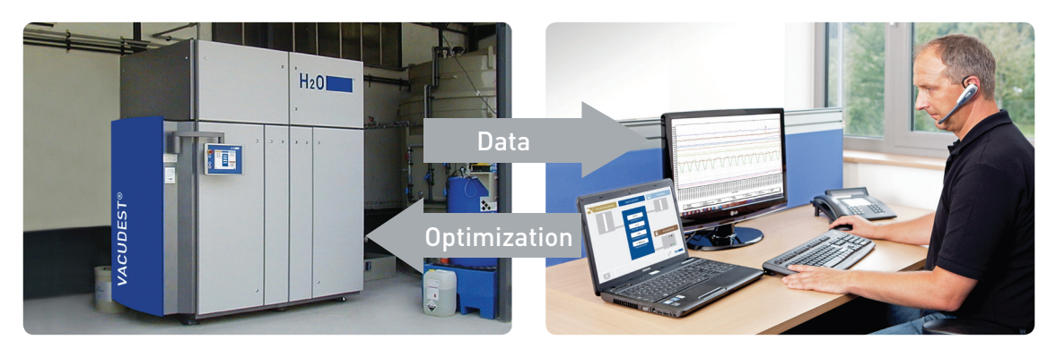
Efficient process optimization: The Vacutouch control system allows direct VACUDEST process data transfer to our technical customer support.

Via remote control your system parameters are optimized. This saves time, money and ensures optimized system availability.