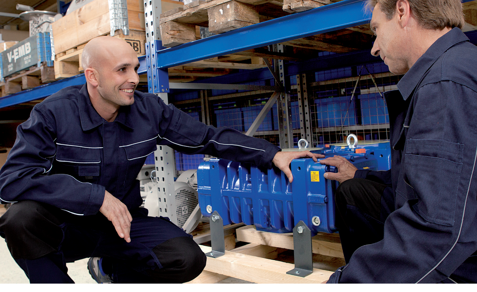
The product file of your VACUDEST system allows us to deliver spare parts very fast. If you order before 1 p.m. on workdays, your parts will be sent to you that same day.