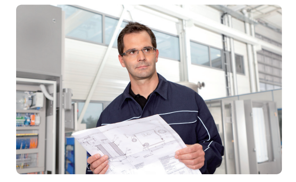
System re-engineering during ongoing production require perfect planning. Our specialists rely on more than 30 years of experience, ensuring smooth project execution.