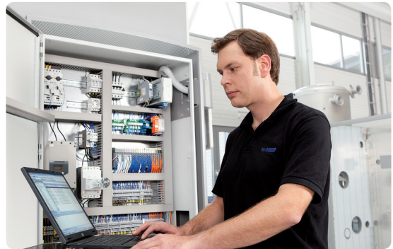
Regular software updates improve performance of your system. Take advantage of cost free software updates, included in our maintenance contracts.