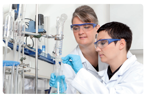
In our application center for zero liquid discharge, we test the effects of your process modifications on the wastewater processing system.