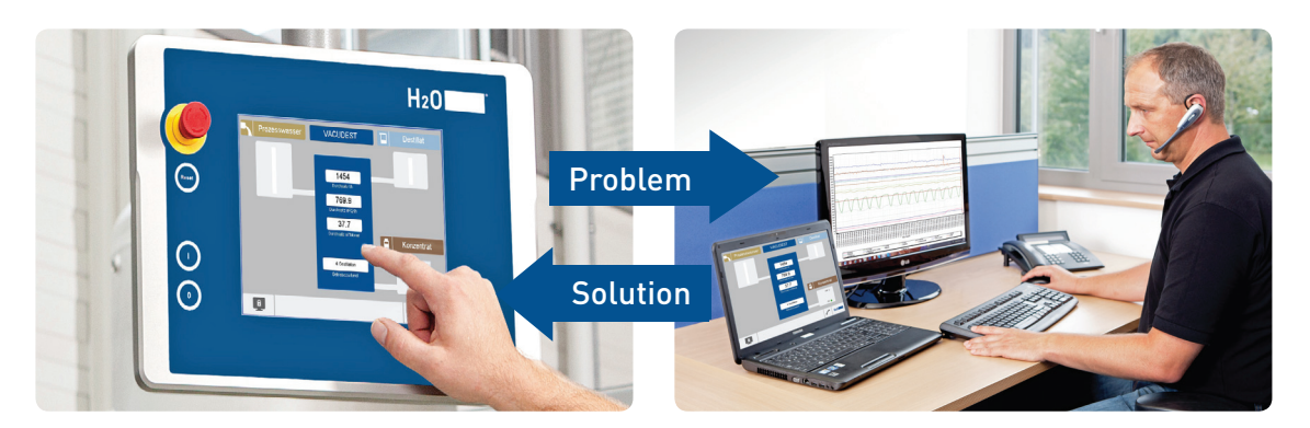
Effective and low cost support: Our Vacutouch control systems transfer process data to our specialized technical customer support team.