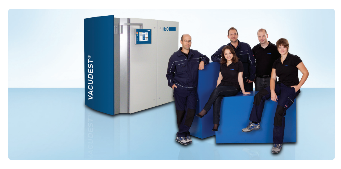
Our H2O service team supports you competent and fast. Be it on the telephone, via remote service or personally, on site. We are at your service.