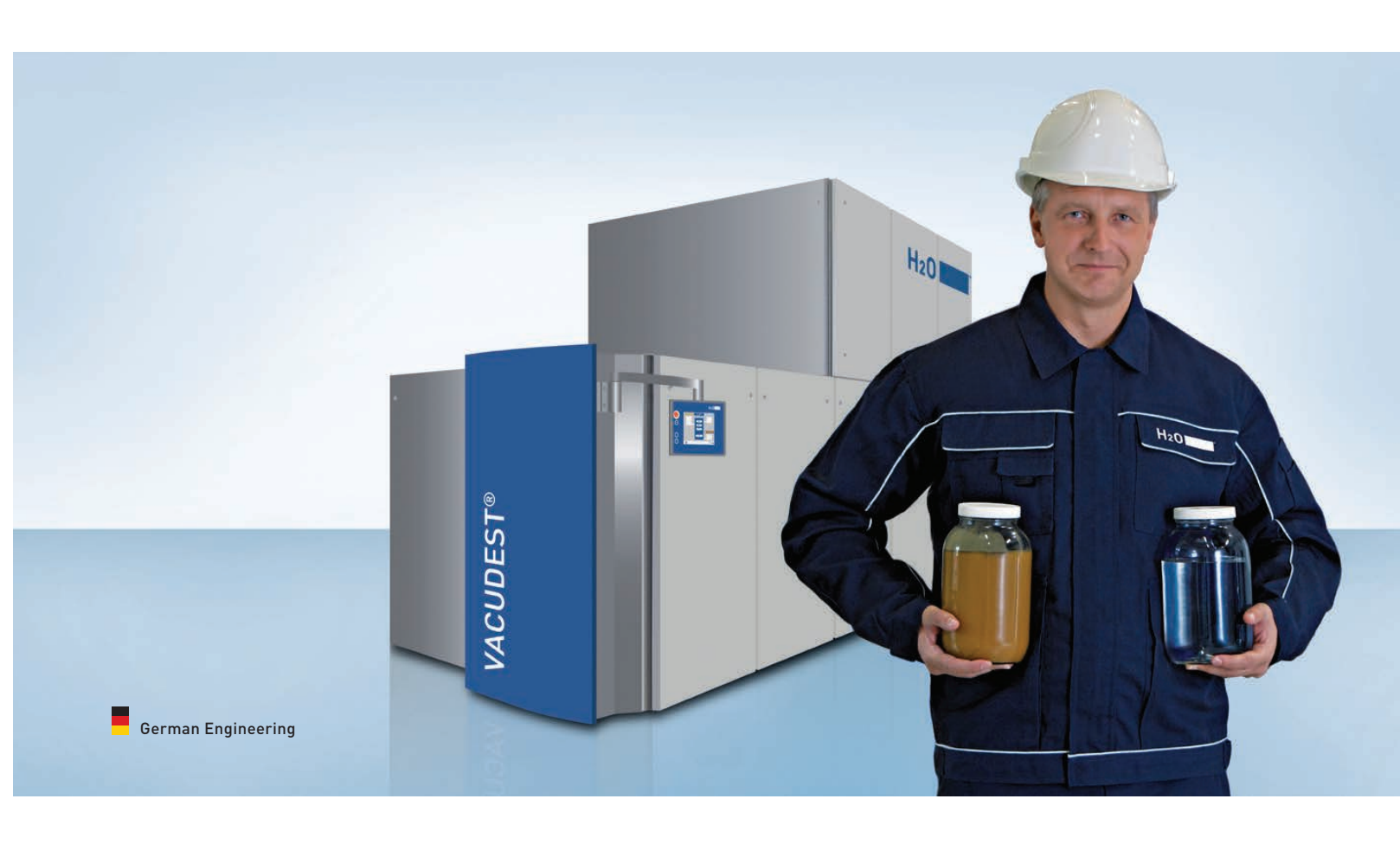
Clearcat. State of the art technology guarantees oil-free distillate.